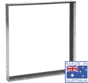
F-Type Holding Frame