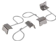
P-Style Holding Clip