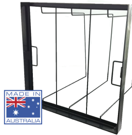
MP610 Holding Frame Set